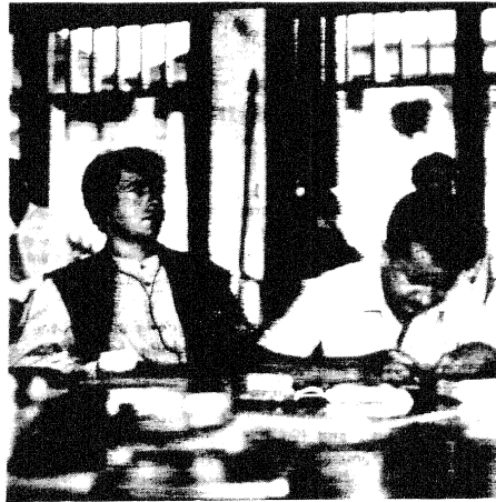
The world-known Rock singer and composer Peter Gabriel (left), during his visit to the University for Peace.

The objectives of the Music for Peace Program is to establish a Global Computer Network which will serve the world in its struggle for peace in a very large diversity of ways. Many of the most distinguished thinkers and institutions of our times will be logged into the network, in order to conform them into international advisory boards on the main issues affecting world peace. We will establish a data bank and an advisory team to deal with issues such as social communication, refugees, human rights, conflict resolution, international economic order, etc., and how they affect or relate to peace.